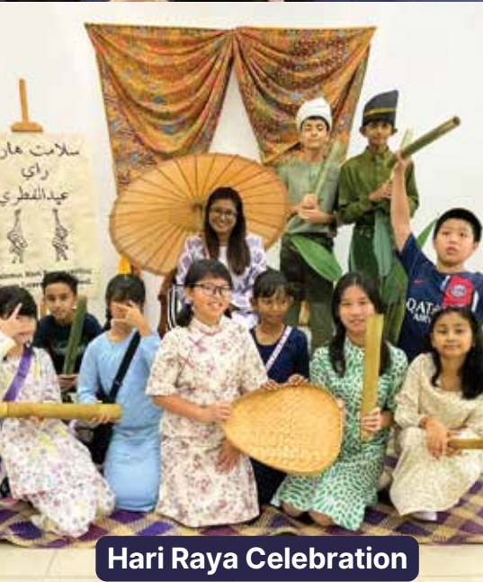
Hari Raya Celebration

ZIS EVENTS Academic Awards Ceremony Merdeka Celebration Mid Autumn Festival Fundraising Carnival Deepavali Celebration Children's Day/ Odd Socks Day Christmas Celebration Annual Sports Day Chinese New Year Celebration Inter School E-Games Competition Hari Raya Celebration Annual School Concert Teacher's Day Celebration Graduation Secondary School Camping Preschool & Primary School Excursion