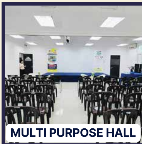
MULTI PURPOSE HALL