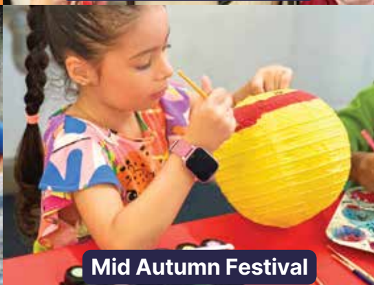
Mid Autumn Festival