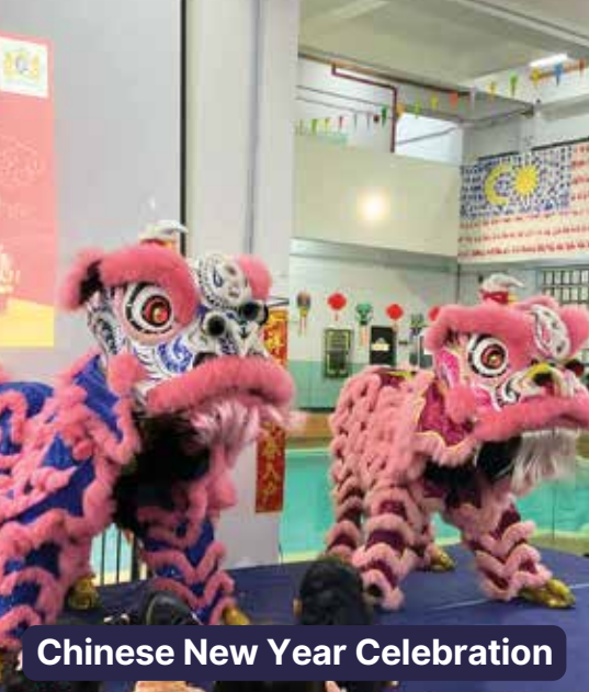
Chinese New Year Celebration