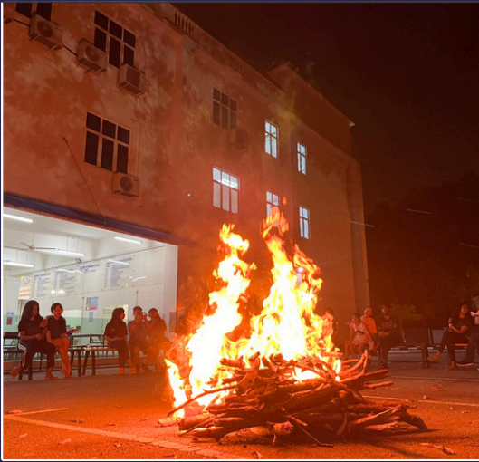
ZIS Prefect Camp 2024