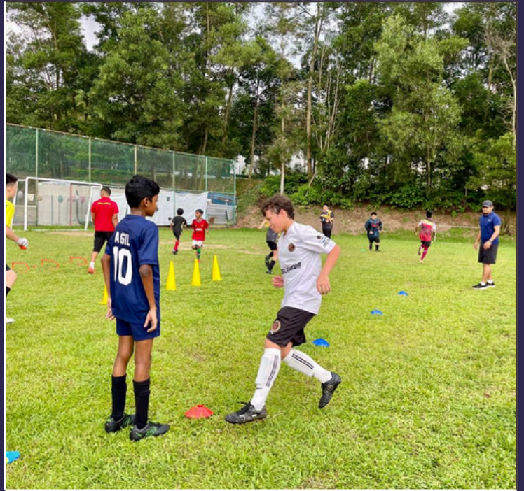
Football Academy Coaching