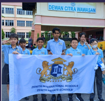
MSSD Chess Competition