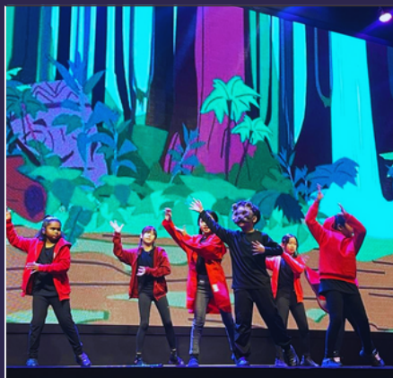
ZIS Annual Concert 2024