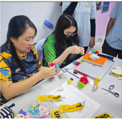
ARTS & CRAFT CLUB